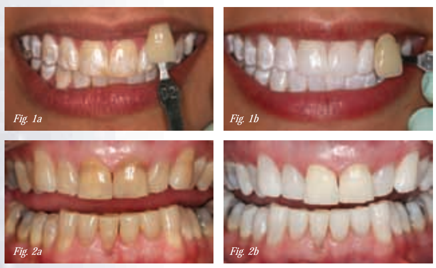
Figs. 1 & 2: Effective KöR Whitening results.

This is the big payoff. Don't step over the dollars to pick up the pennies. Impress those new patients and make them yours!