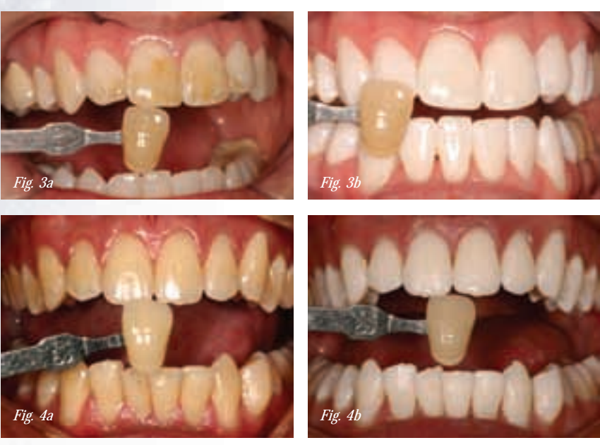
Figs. 3 & 4: Effective KöR Whitening results.

The bottom line is that most whitening results are not that spectacular. Maybe your patient is happy her teeth are a little whiter, but others don't even notice, and