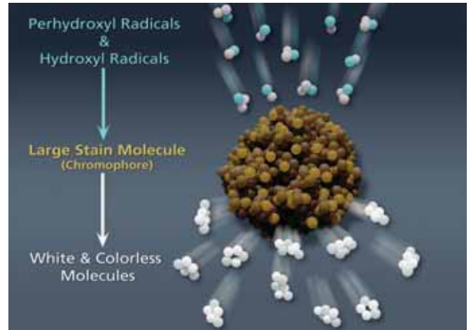
Fig. 3: Bleaching factor radicals (especially perhydroxyl radicals) liberated by the breakdown of hydrogen peroxide attack and break apart the chromophore bonds of large, long-chain dark color molecules, eventually breaking these molecules into molecules so small that they have no chromophore bonds, which results in the whitest possible teeth.

As the vast majority of dentists have found, there are problems with whitening systems, preventing them from accomplishing these requirements. 2,4 We will now discuss the reasons that each of the requirements may not be met by typical whitening systems.