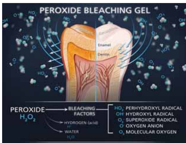
Fig. 2: Upper left: After years of compaction of intrinsic stains, and joining of these molecules throughout the microstructure of the teeth, the result is a densely packed, tightly woven matrix throughout the microstructure of the teeth, effectively preventing the penetration of bleaching factors into the teeth. Upper right: Bleaching factors can easily penetrate tooth structure in young teeth that have not yet been densely packed with debris, and in older teeth that have been cleansed by hours of continuous oxygenation by peroxide bleaching factors. Lower: Hydrogen peroxide ( H_2O_2 ) is the active end product of all peroxide whitening systems. H_2O_2 , depending on the whitening gel storage temperature, whitening tray environment and whitening gel chemistry, may break down to ineffective oxygen and water, or it may break down to effective bleaching factors including free radicals. When radicals are produced, hydrogen ions (acid) are also produced.