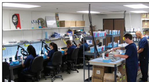
The KöR Lab.